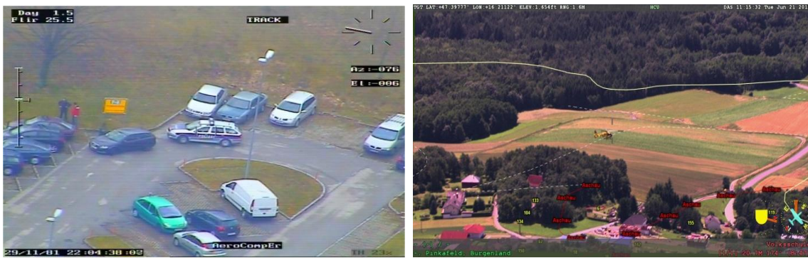
Examples of live video transmissions - including geo-data blended into the video

The aircraft is outfitted with two types of SCOTTY data transmission systems: <u>line-of-sight ("LOS")</u> and <u>beyond line-of-sight ("BLOS")</u>. Both systems are used to transmit mission-critical information such as surveillance imagery and target data. The LOS system is limited to a range of approximately 100 kilometers (depending on the frequency) but can transmit higher quality live video imagery. The BLOS system uses a satellite link enabling it to have unlimited range - the live video is limited in quality but the system can transmit high quality (HD) still pictures and can provide duplex telephony.