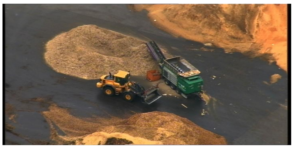
A HD snapshot received via satellite

Surveillance imagery gathered by a patrol aircraft should not be stranded onboard the plane. This vital information must be shared, in real time, with commanders on the ground. The SCOTTY system makes this possible through LOS and BLOS transmissions.